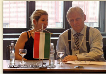
Istvan Tarlos, Mayor of Budapest